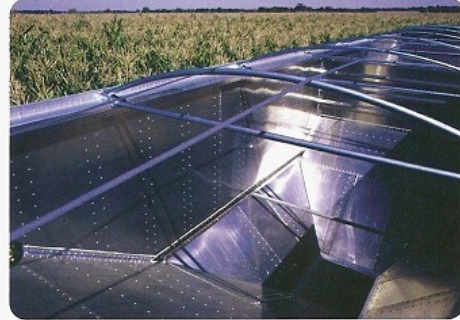
Merritt's FLO-THRU, lap-seamed corners allow the product to funnel out cleanly and completely every load. No cross bracing inside. New, stronger top rail.