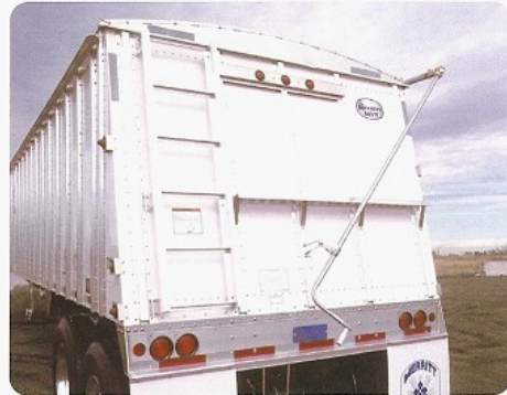
Corrosion-resistant rear butt plate. Lighter. Brighter. No repainting required.