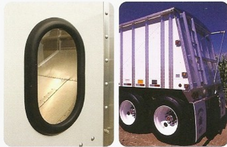
Large Sight Windows, optional, 4 per side positioned above doors.